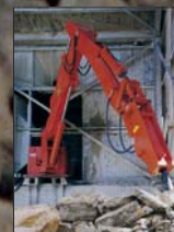
Pedestal Breaker Systems