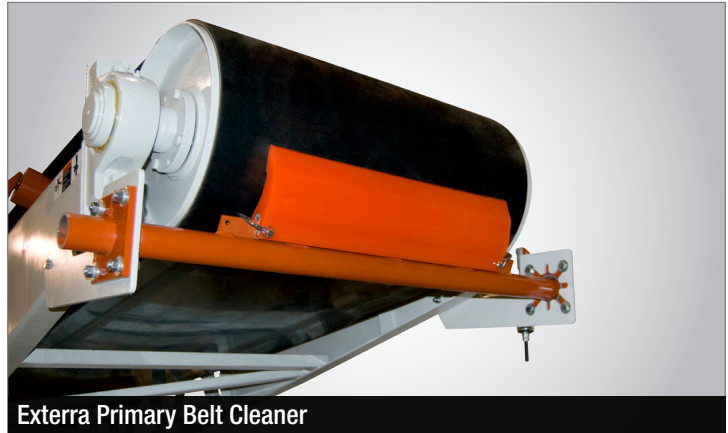
Exterra Primary Belt Cleaner