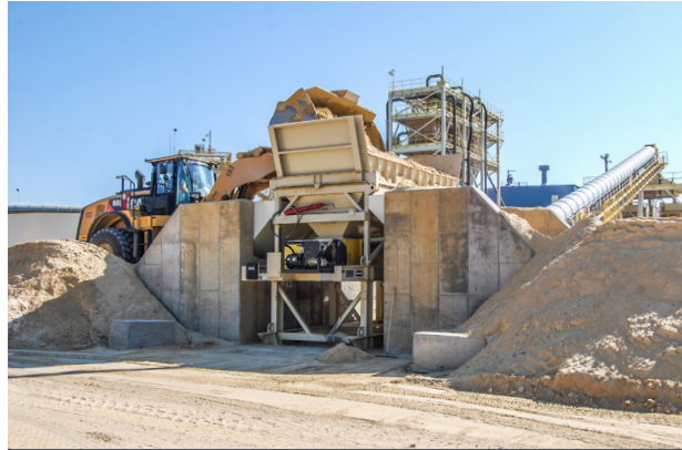
SKID-MOUNTED FEED HOPPER