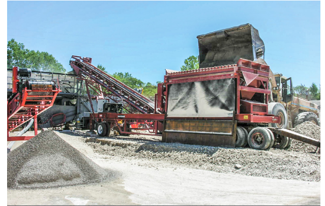
FEEDING WASH PLANT