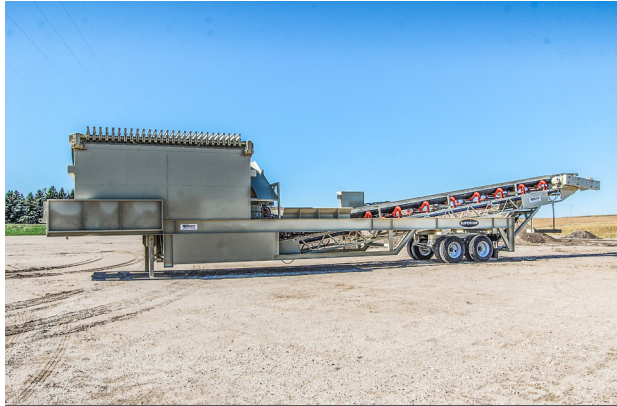
PORTABLE FEED HOPPER