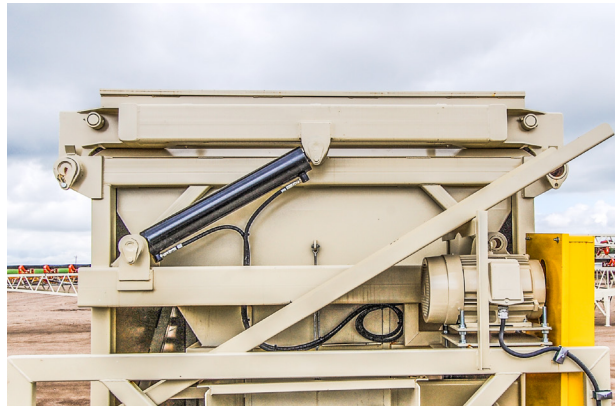
HYDRAULICALLY CONTROLLED DUMPING BARS