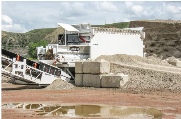
FEED HOPPER WITHOUT DISCHARGE CONVEYOR