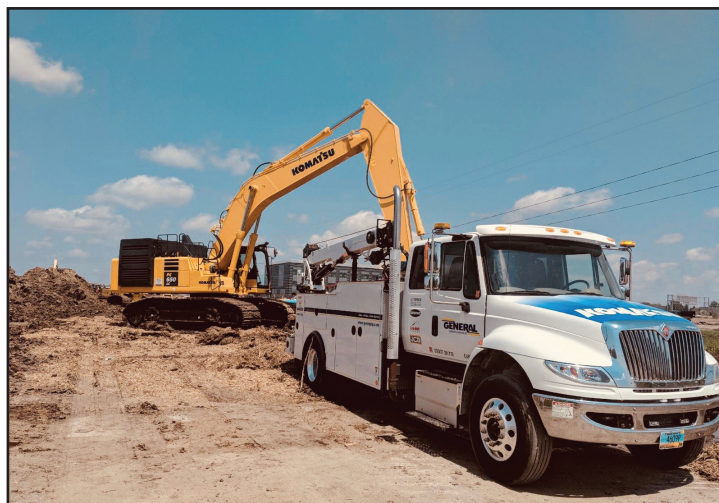
3rd Place: Landon Caughey (Fargo)