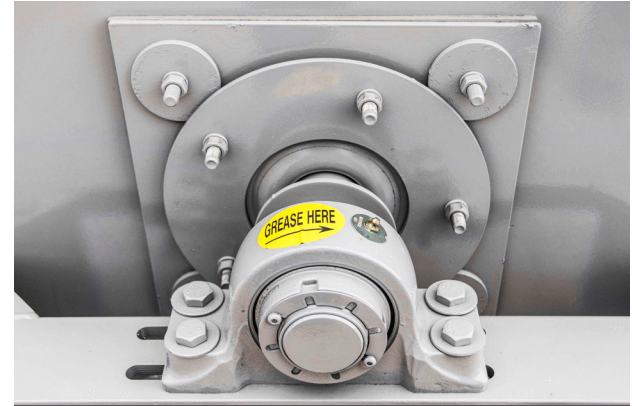
SLINGER PROTECTS LOWER BEARING