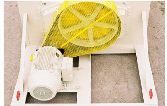
GUARDED DRIVE SYSTEM