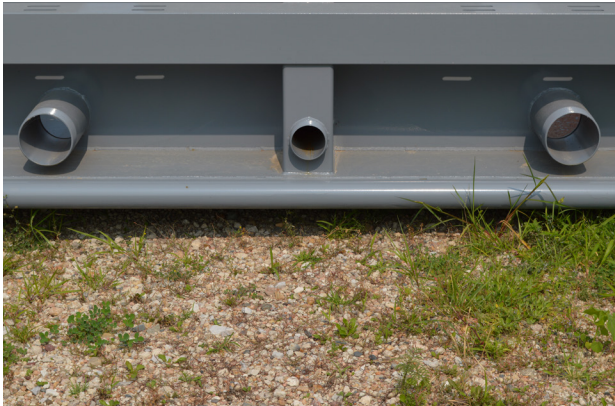
EASY ACCESS TO DRAIN AND FILL