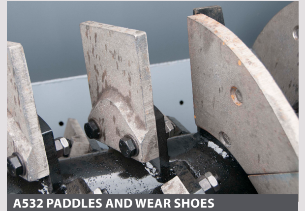
A532 PADDLES AND WEAR SHOES