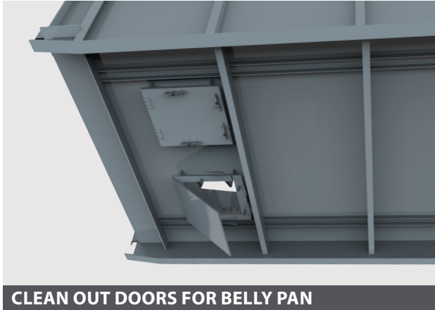
CLEAN OUT DOORS FOR BELLY PAN