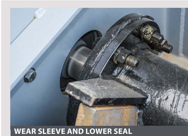
WEAR SLEEVE AND LOWER SEAL