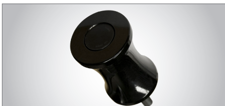
Fig 6.1 Softer Landing for Belting