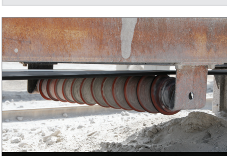
Fig 8.1 Spiral Urathon Return Roll

► Yes, however it involves removing the weld on the retaining ring in order to slip the discs off the shafts.