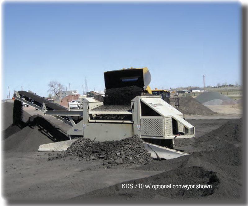
KDS 710 w/ optional conveyor shown

Designed for construction and recycling contractors, the KDS 710 is easy to operate and highly reliable in processing recycled materials, crushed stone, demolition waste, topsoil and more. This robust machine offers heavy-duty plate steel and AR liners in the hopper area along with other high impact areas giving a much longer life while processing demanding loads. Capable of processing on-site and in tight construction areas, the KDS 710 reduces hauling costs and minimizes material purchase requirements.