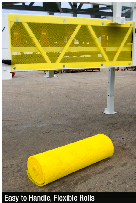
Easy to Handle, Flexible Rolls