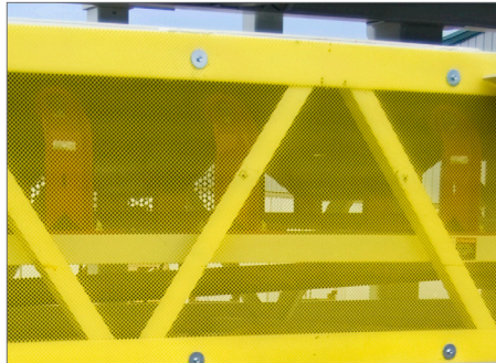
Fig 19.1 Flexible Guard Panels