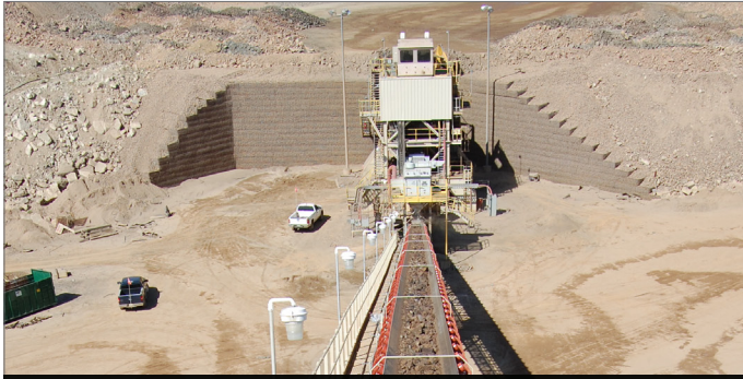
High Capacity Applications