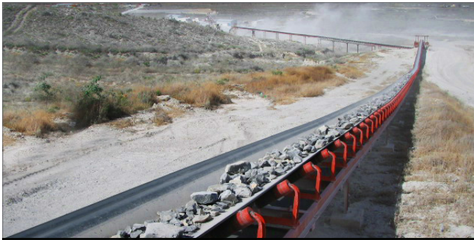
Sharp, Damaging Material