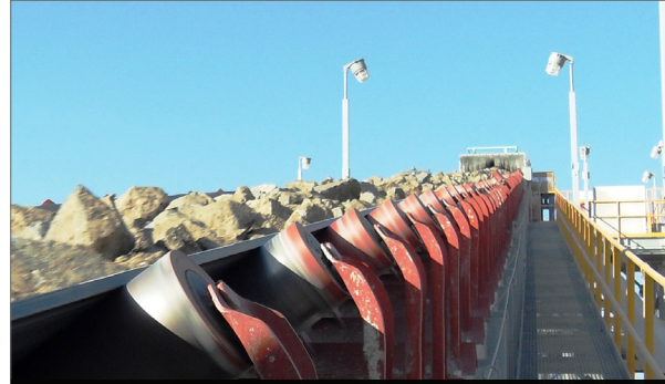
Large Material Lumps