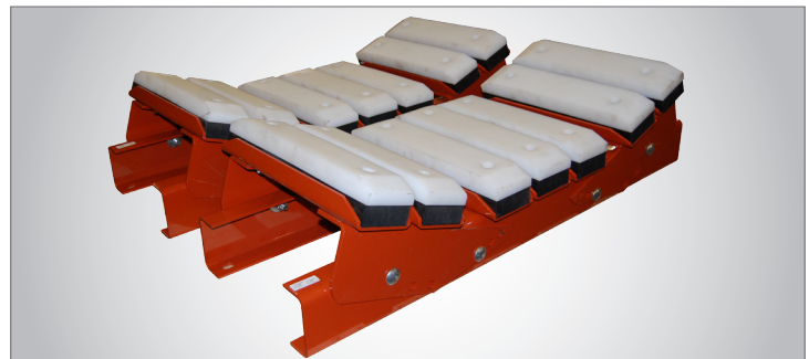
18" Impact Beds