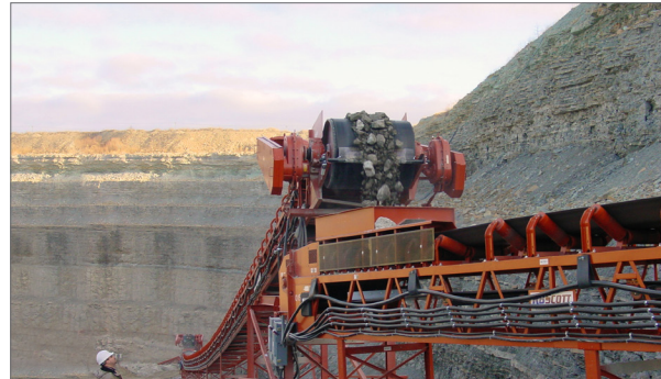
Extended Discharge Height