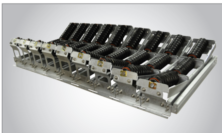
Fig 20.1 Specialty Impact Transition Bed