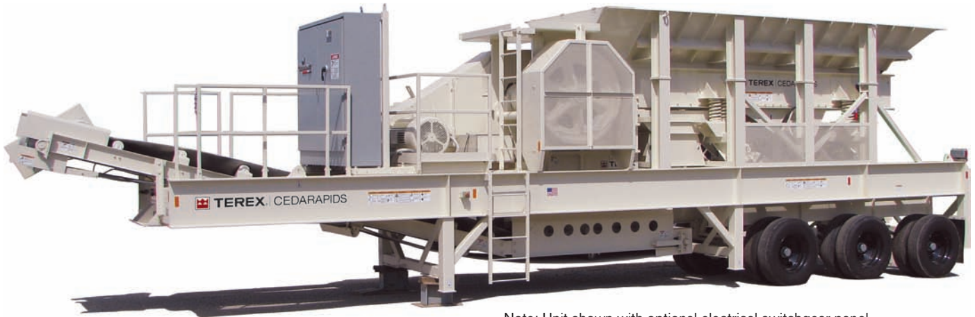
Note: Unit shown with optional electrical switchgear panel