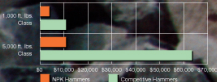
Sleeve vs. Main Body Replacement Cost Comparison

Hammers aren't meant to have an easy life. They occasionally need to be rebuilt. When the hammer body is involved, NPK's replaceable sleeve design can reduce your costs by a factor of five to ten . Here are the typical costs involved to re-sleeve the body of an NPK hammer and replace the main body of a hammer from another major manufacturer.