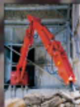
Pedestal Breaker Systems