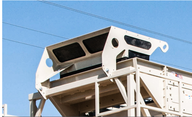
CENTERING HOPPER IMPROVES EFFICIENCIES