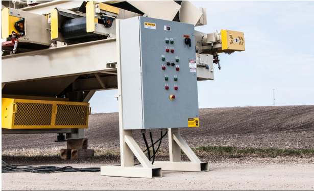
SEPARATE, SKID-MOUNTED ELECTRICAL PANEL