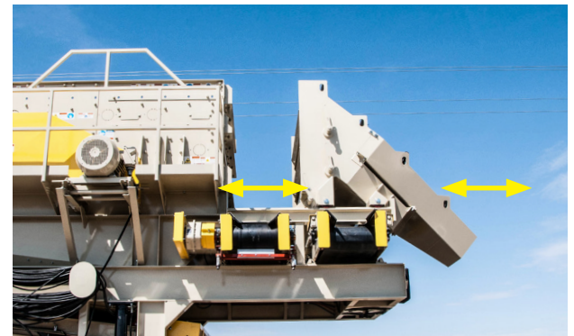
ROLLAWAY DISCHARGE CHUTE FOR MEDIA ACCESS