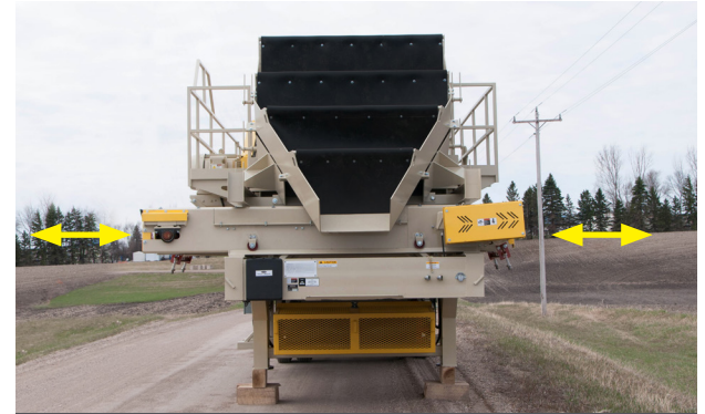
CROSS CONVEYORS EASILY ROLL BY HAND