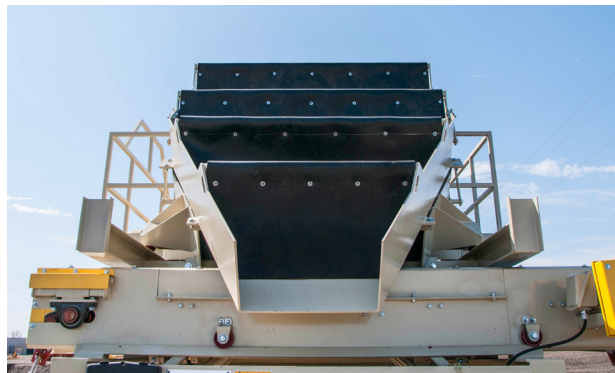
HIGH WEAR 3/8" AR400 STEEL DISCHARGE CHUTES