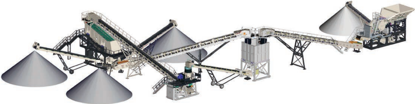
System 200 2-Stage Modular Plant (Jaw-Cone-Inclined Screen)