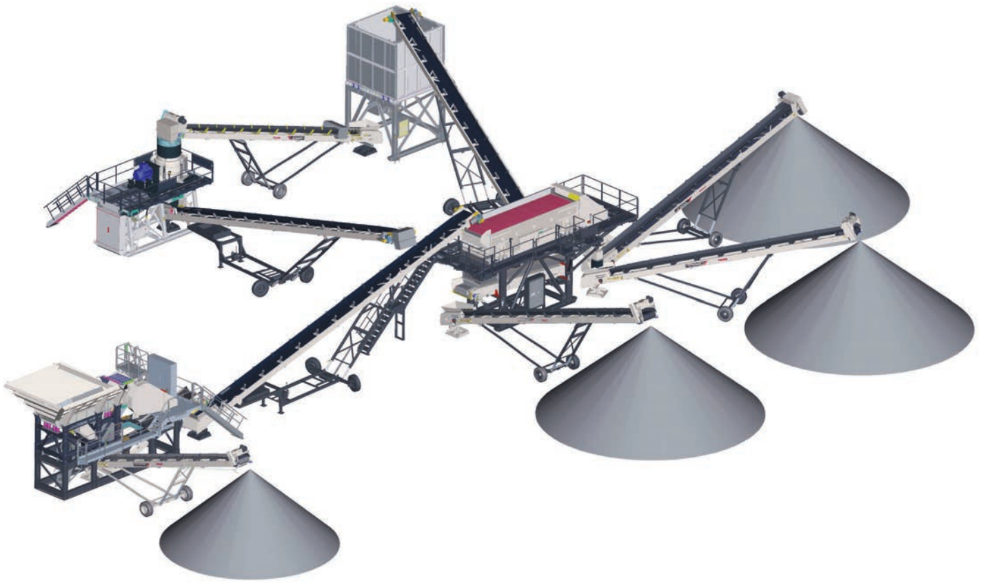
System 200 2-Stage Modular Plant (Jaw-Horizontal Screen-Cone)