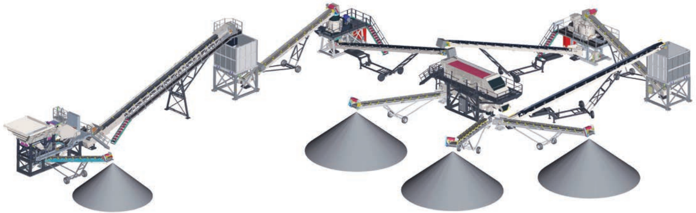
System 200 3-Stage Modular Plant (Jaw-Cone-Horizontal Screen-VSI)