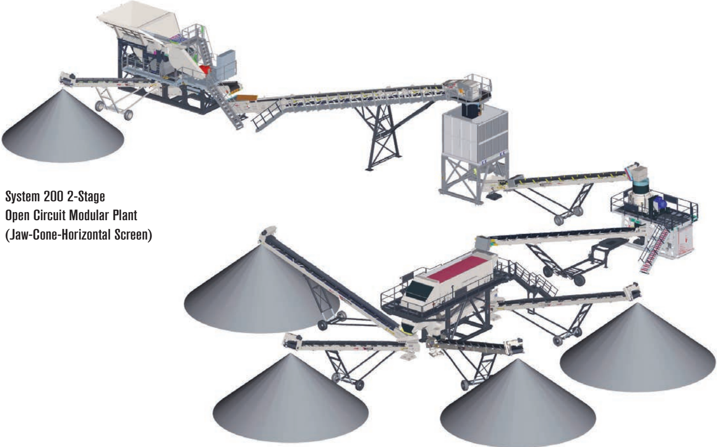
System 200 2-Stage Open Circuit Modular Plant (Jaw-Cone-Horizontal Screen)