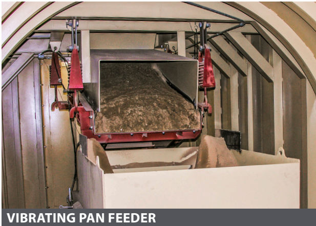
VIBRATING PAN FEEDER