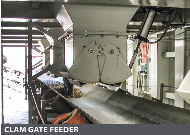
CLAM GATE FEEDER