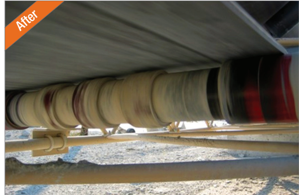
Urathon Return Roll Sheds Sticky Material