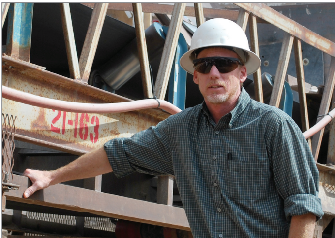
Plant Manager at Phoenix Cement Company, Scottsdale, Arizona