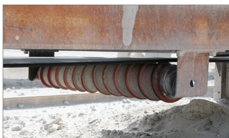
Fig 8.1 Spiral Urathon Return Roll