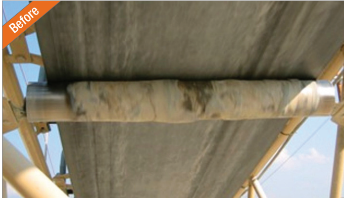
Sticky Material Clinging to Steel Returns Causes Belt Mis-tracking